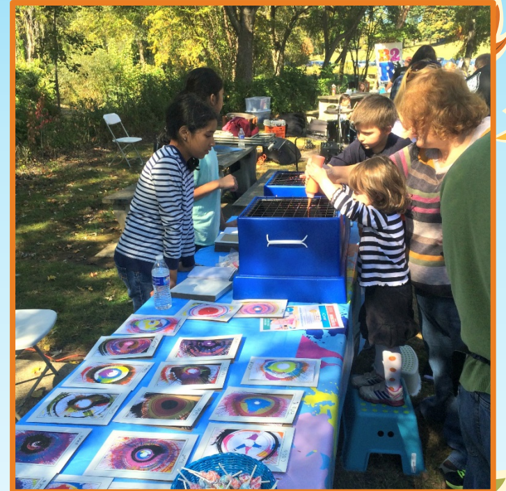
Spin art with Kumon Learning Center