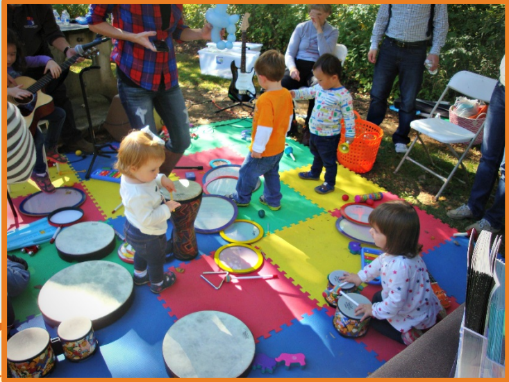
Bach to Rock's instrument petting zoo & talented musicians