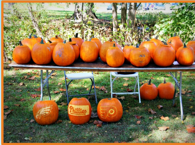
Steve Clarke, the world's fastest pumpkin carver!