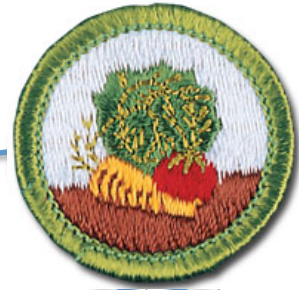
4: Skunk Hollow Garden