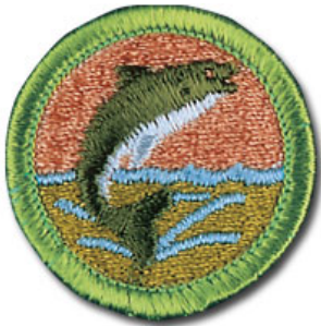
1: Aquatic Life