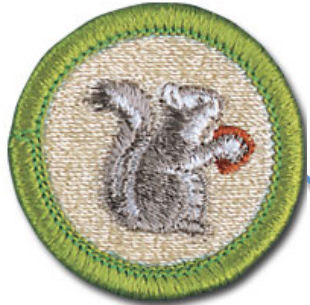
2: Native Animals/ Reptiles