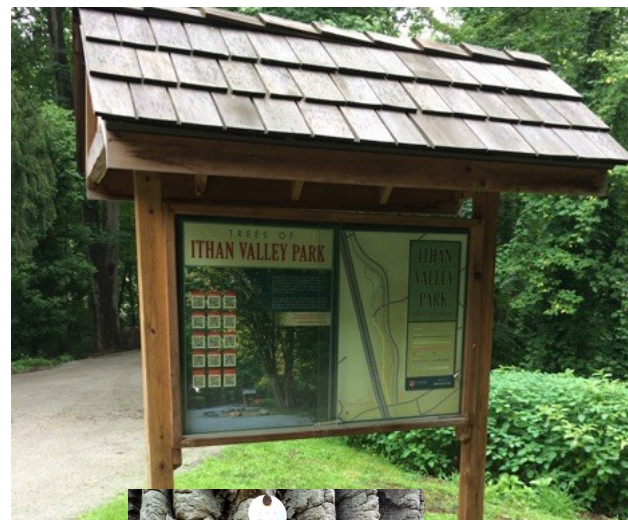
New Park Kiosk And Quick Reader Codes Sign