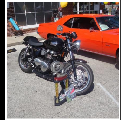
BEST IN SHOW MOTORCYCLE Bela Kovacs