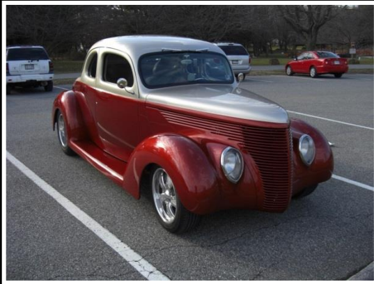
BEST IN SHOW CAR Clare Bingman