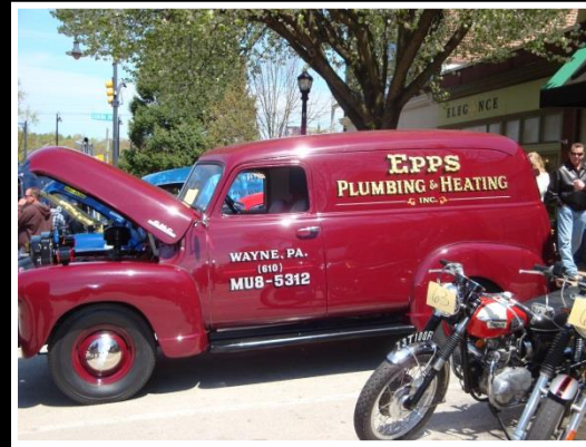
BEST IN SHOW TRUCK Alan Epps, Epps Plumbing & Heating