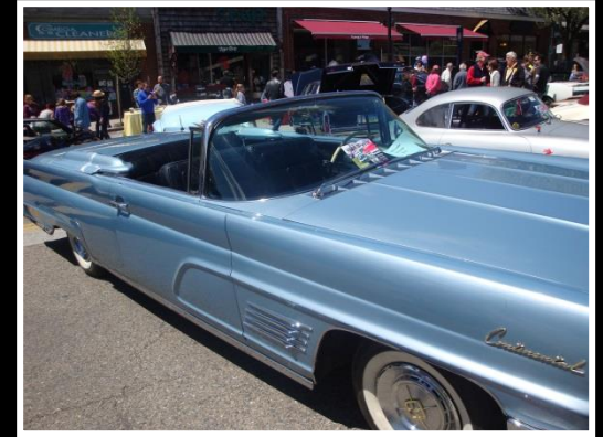
BEST CONVERTIBLE Bill Conlan