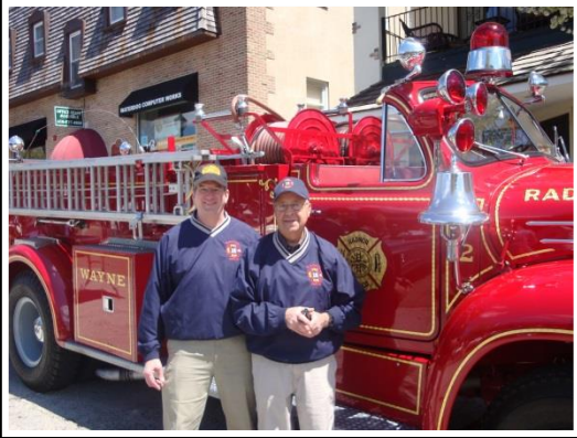
BEST PUBLIC SAFETY/UTILITY VEHICLE Radnor Fire Company