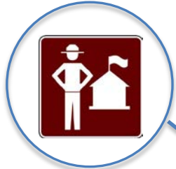
Picnic Grove - Registration Area

Radnor Township Parks & Recreation Department