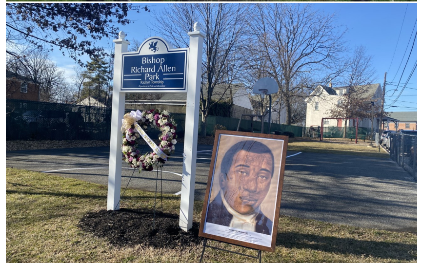
Annual Honoring & Wreath Laying Ceremony Bishop Richard Allen's Birthday February 14th