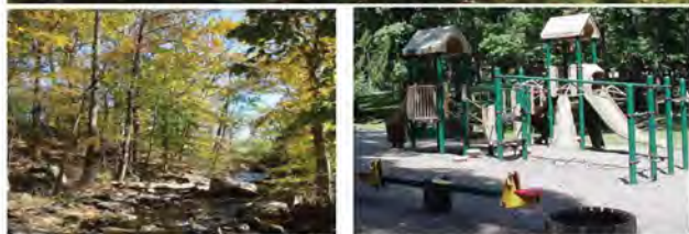
A Look at the Parks, Facilities & Recreational Amenities of Radnor Township

Created by the Radnor Township Recreation & Community Programming Department / 2014