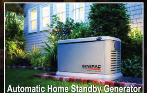
Automatic Home Standby Generator

THE PURCHASE & INSTALLATION OF A GENERAC HOME STANDBY GENERATOR OFFER EXPIRES 10/31/16