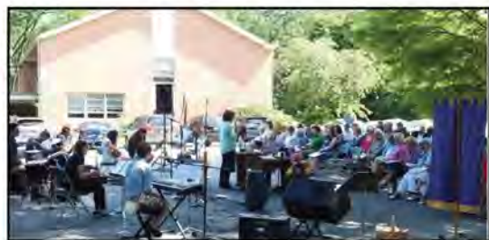
Outdoor Worship, Sunday, June 5

At Saint Luke, every person's identity is recognized and celebrated as a gift from God –no exceptions!