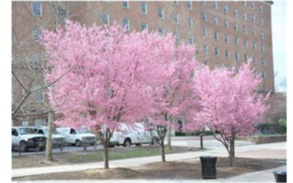
Small Flowering - Flame Cherry