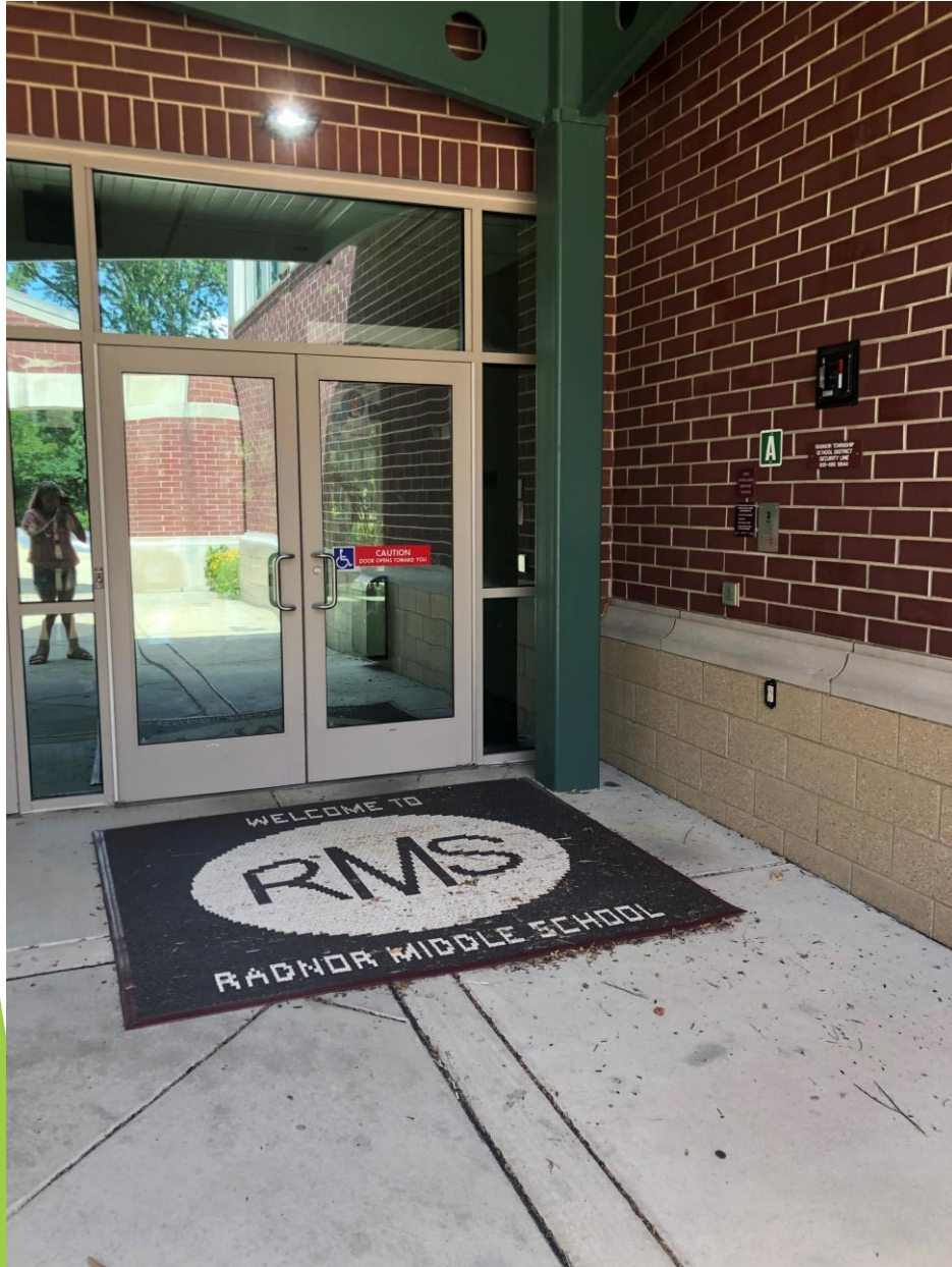
Radnor Middle School