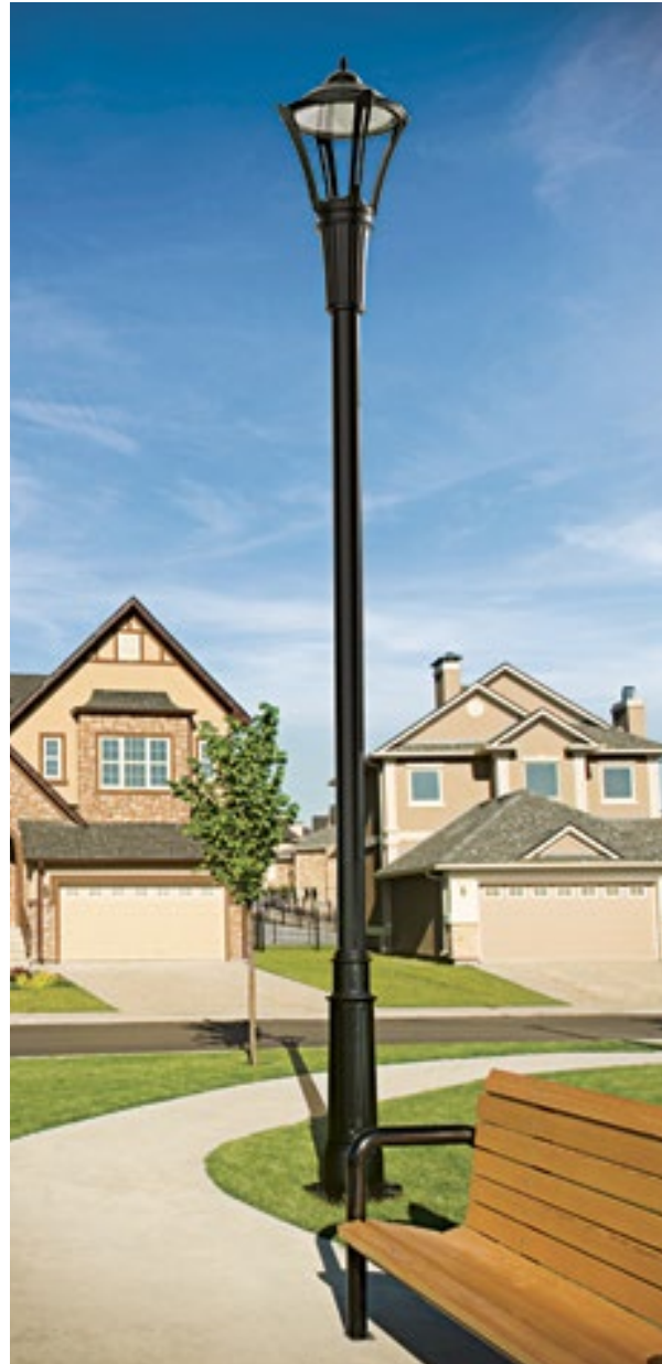
TYPICAL POLE-MOUNTED FIXTURE