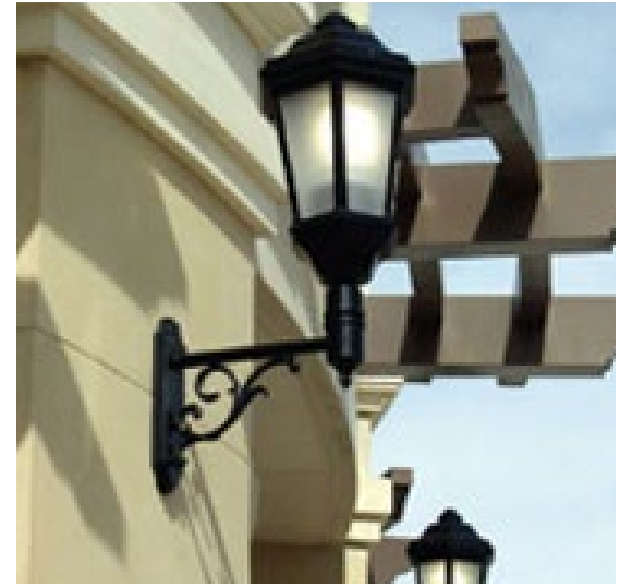
TYPICAL TUNNEL WALL-MOUNTED FIXTURE