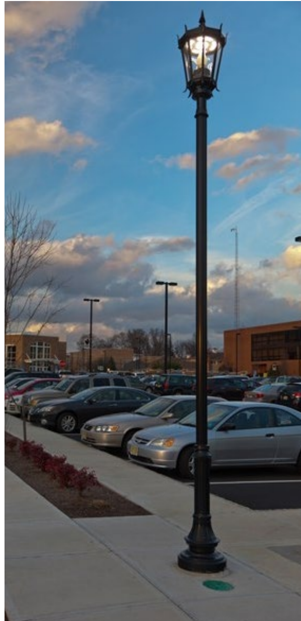
ALTERNATE POLE-MOUNTED FIXTURE