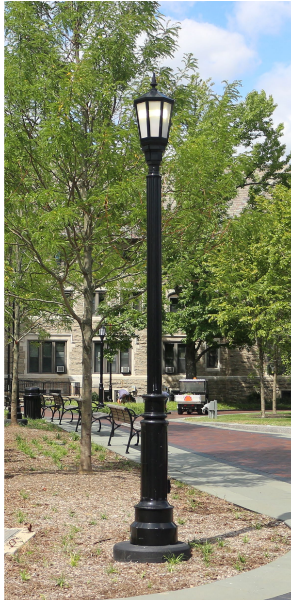
TYPICAL POLE-MOUNTED FIXTURE