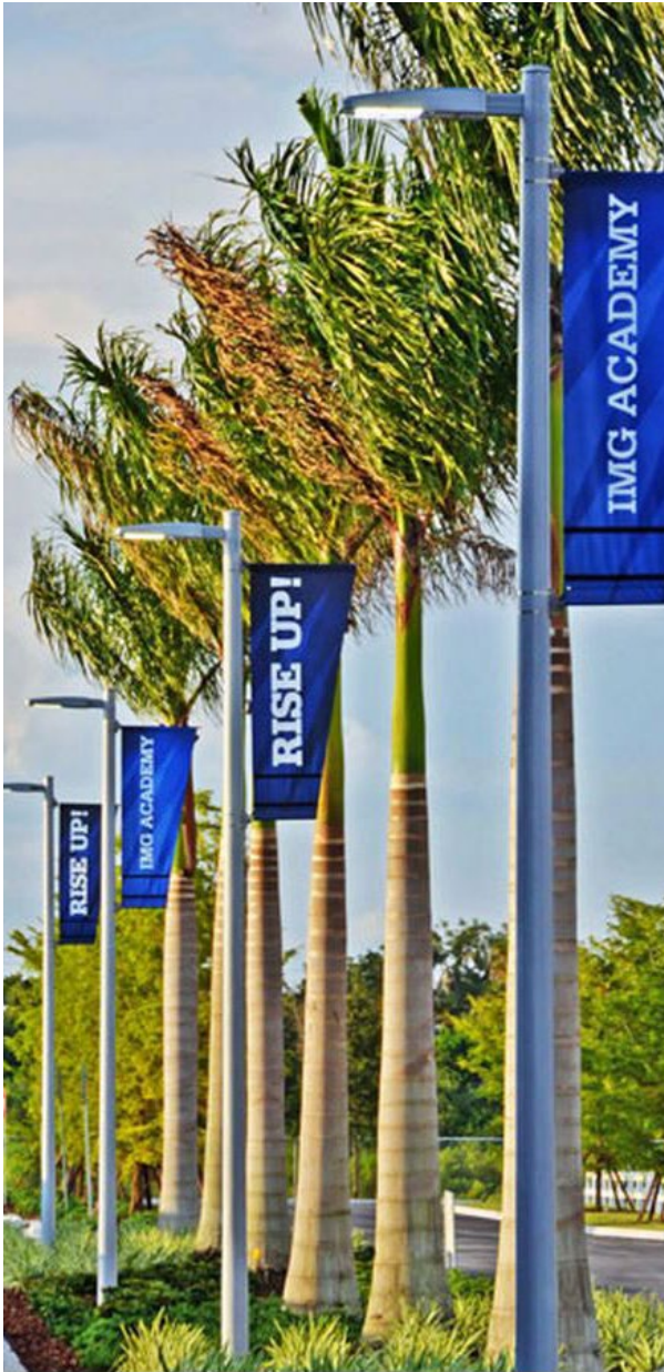
TYPICAL GARAGE ROOF FIXTURE