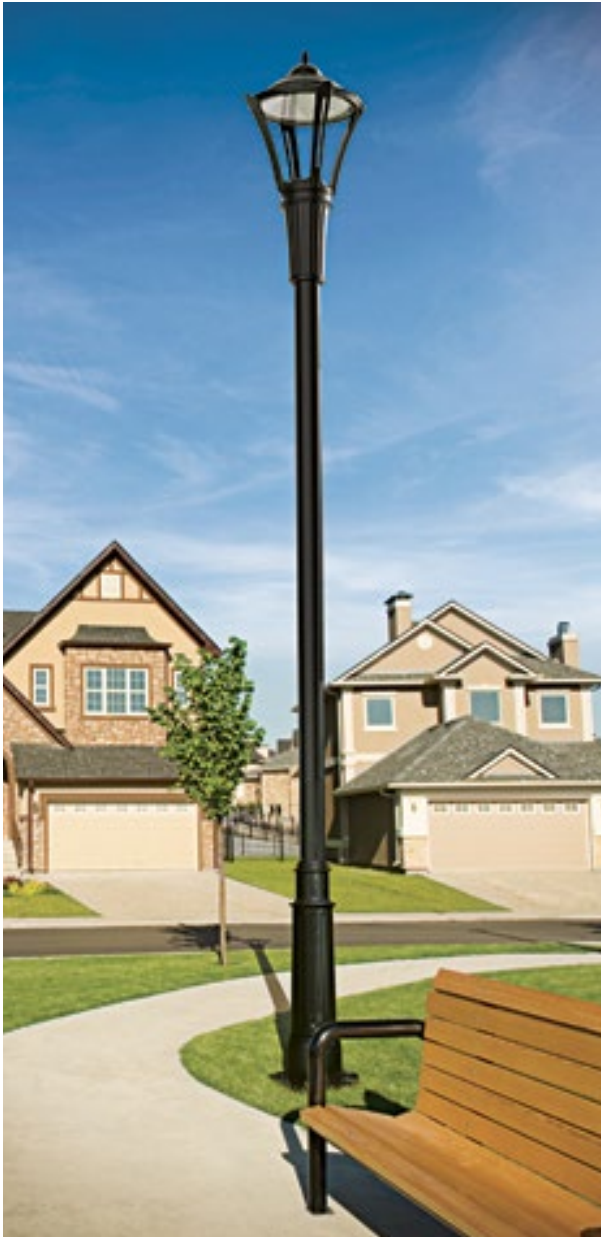
TYPICAL POLE-MOUNTED FIXTURE